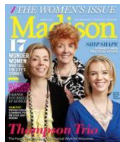
Business: The Messengers