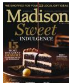
Lifestyle: To-Do List Fun