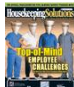
Trade: Healthful Cleaning