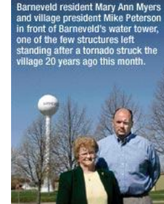
Feature: Worst Tornado