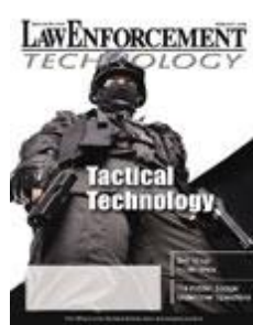
Feature: Police on Camera